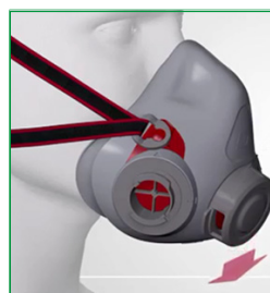
DOWNWARD FACING EXHALE VALVE