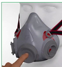
POSITIVE FIT CHECK BUTTON

AVIVA has been designed with the safety and comfort of the wearer at its heart. With a number of features designed to improve comfort, fit and user confidence, workers can be assured that their half mask fits and will protect against a wide range of hazards. Patent information is available at www.scottpatents.com