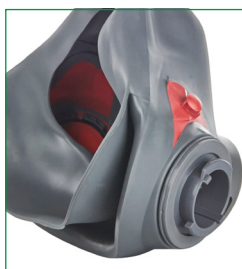
HYBRID REFLEX SEAL